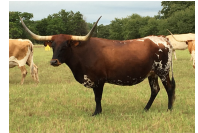
LAR BROVITA 8/11