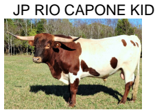
JP RIO CAPONE KID