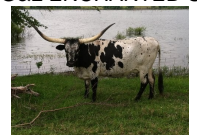
G&L ENCHANTED SUE